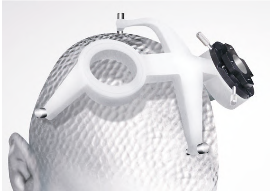
Patient and procedure customized Platform illustrating flexibility of form possible with SLS fabricated Platform.